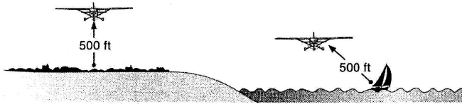
■ Figure 2-11 Maintain 500 ft clearance

Except with the written permission of the CAA, an aircraft shall not be flown closer than 500 feet to any person, vessel, vehicle or structure.