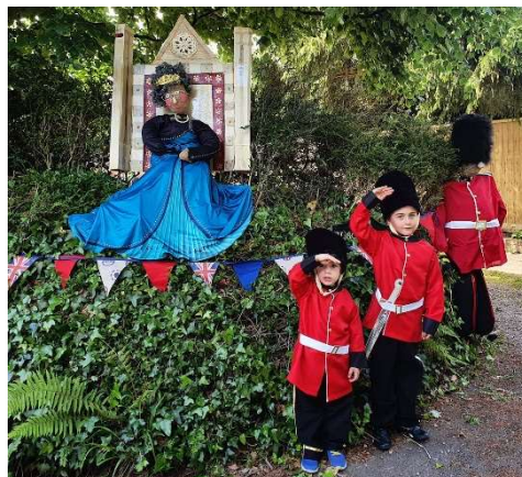
Congratulations to 1st place winners