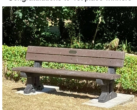
Queen's Jubilee Bench at St Michael's