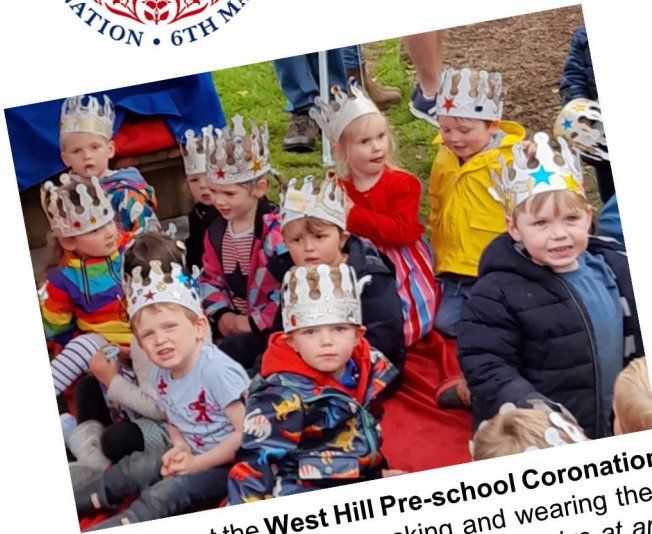
Children at the West Hill Pre-school Coronation picnic had great fun making and wearing their crowns (and expecting The King to arrive at any moment!)